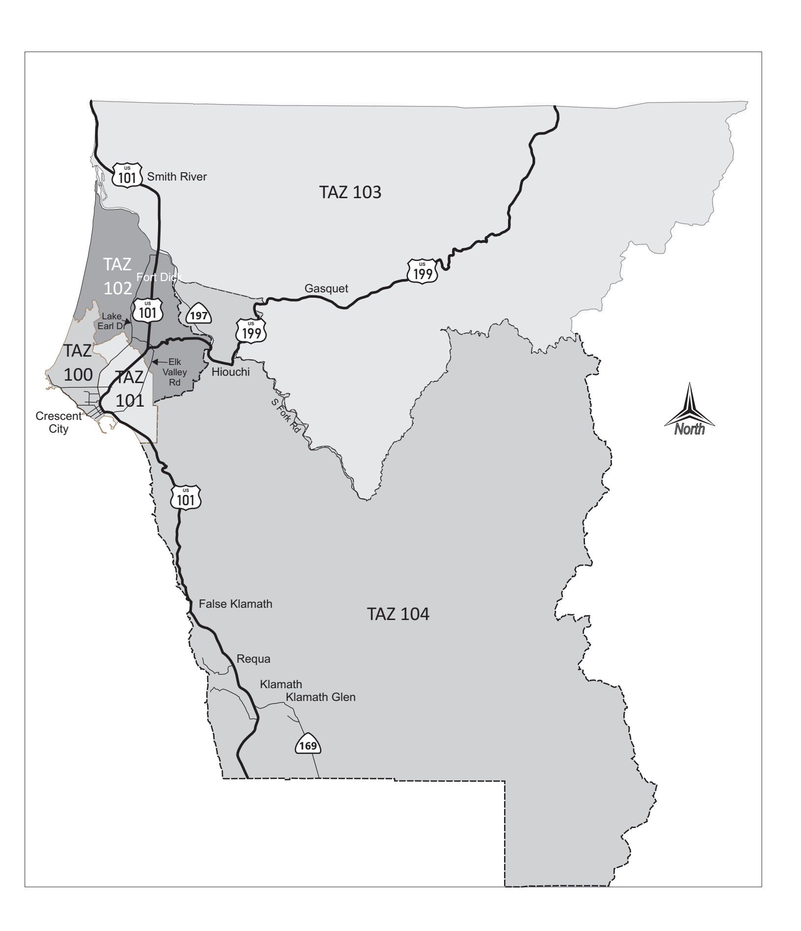
Figure 3-2 Del Norte Region Traffic Analysis Zones